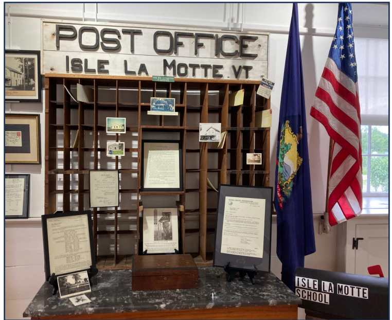
Post Office exhibit 2024.

Have you recently retired, moved back, or plan to move back to Isle La Motte soon and want to get involved in the community? Becoming a docent is a fun way to meet others and learn about the town. We invite you to help us to ensure the Historical Society remains vibrant by increasing the number of our volunteers.