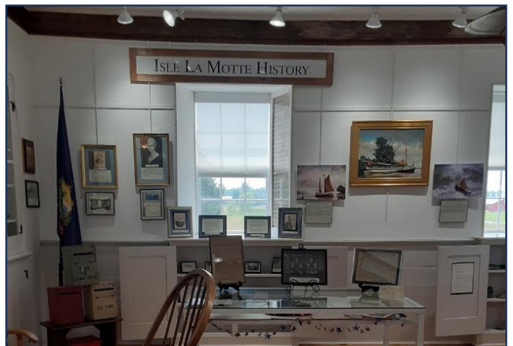
The Shipwrecks exhibit.

Also on display with this exhibit was an original painting of the reproduction ship the Lois McClure by Ernie Hass and a beautiful model of the Lyon ship.