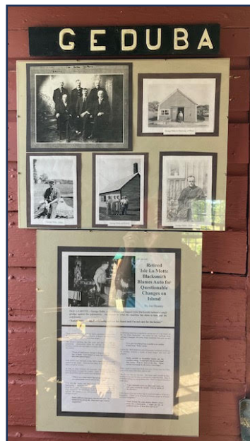
Sample of the Duba exhibit in the Blacksmith shop.

Every new season at the Historical Society brings new and exciting projects and discoveries for the curating team. It seems that every new question we are asked to investigate concerning a facet of Isle La Motte's history becomes an opportunity to add to our Town's story. Our goal is to record those stories and our collected artifacts in a way that makes them available for future generations. Again this year, our goal is to continue to move as much of our collection as possible from a general file into our Past Perfect computer program.