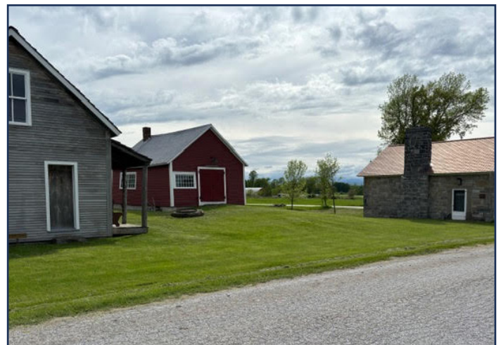
The Isle La Motte Historical Society campus.