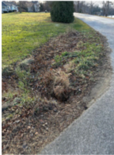
Shallow area on West Shore's right-of-way observed to pool water during heavy rainfall, high lake water, and snow thaw