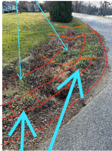
Shallow area on West Shore's right-of-way observed to pool water during heavy rainfall, high lake water, and snow thaw