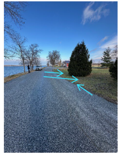
View of West Shore Road and New Road intersection looking north

Here we want to build a header out of larger stone, whether or not you use the large stone all the way to the shoulder elevation or not is up to you. There also should be some erosion stone lining the ditch and the steep parts of the bank as described in the email