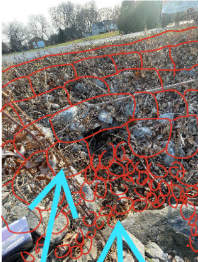
Corroded and blocked culvert at intersection with New Rd.

This is the area that should be stone-lined in both directions.