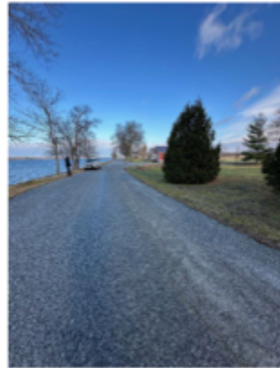
View of West Shore Road and New Road intersection looking north