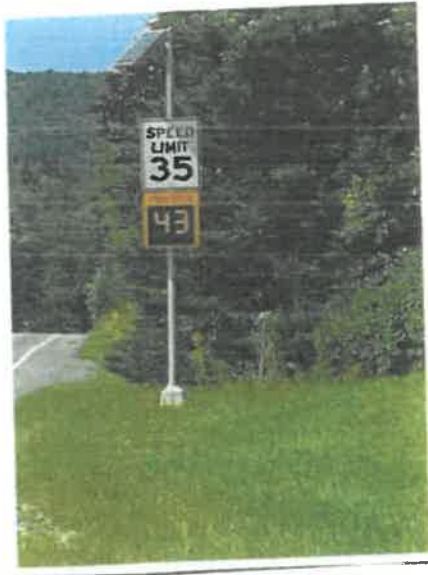
Vt Route 14 Woodbury North & South entrance to village